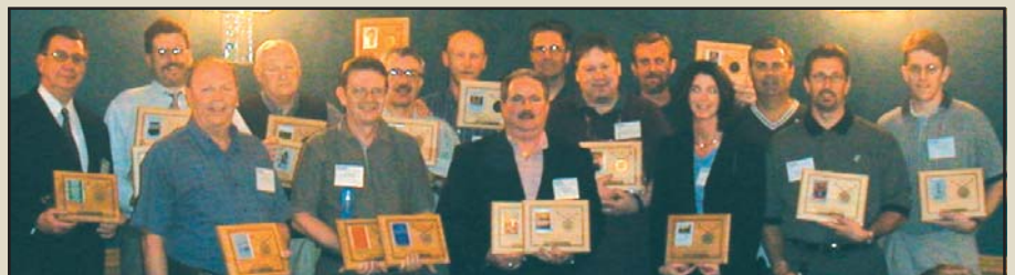
Proud winners of 3rd Annual Print Quality Awards